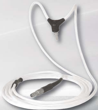
P/N SYC-2900 Luxtec Replacement

All of our fiberoptic cables are manufactured to a high standard of quality, performance, and reliability. They are skillfully manufactured in house with medical grade materials and comply with FDA regulations and ISO 13485 certification. New to our extensive line of fiberoptic cables is CUDA Surgical's Molded SureGrip handle, a patented ergonomic design feature that provides added strain-relief, durability, and ease of cable removal from the lightsource.