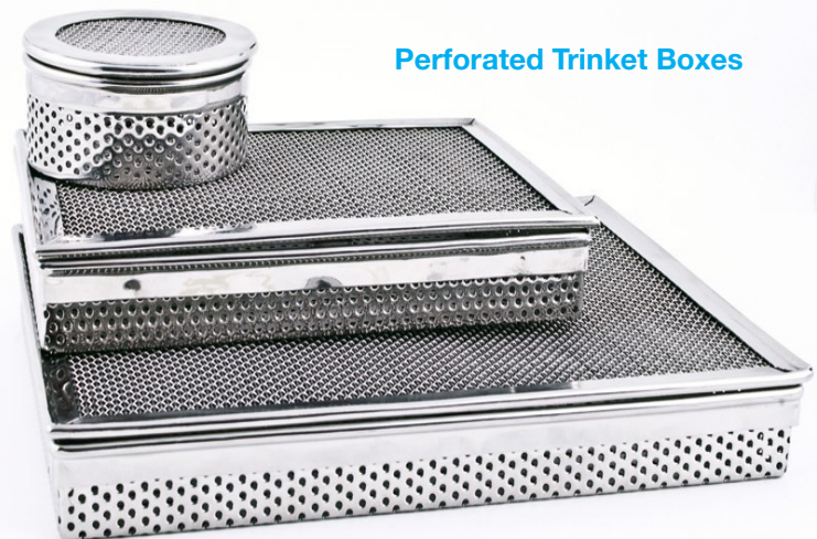
Perforated Trinket Boxes