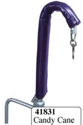
41831 Candy Cane