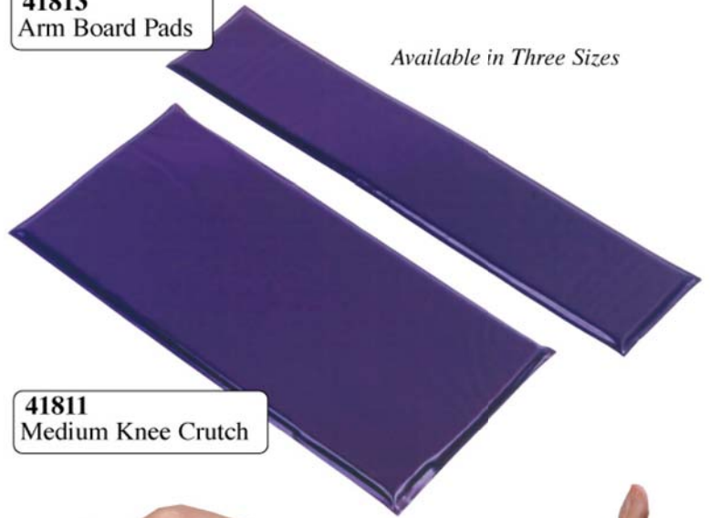
41811 Medium Knee Crutch