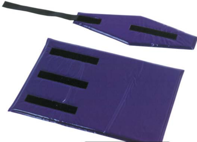
41820 Square Ulnar Nerve Pad