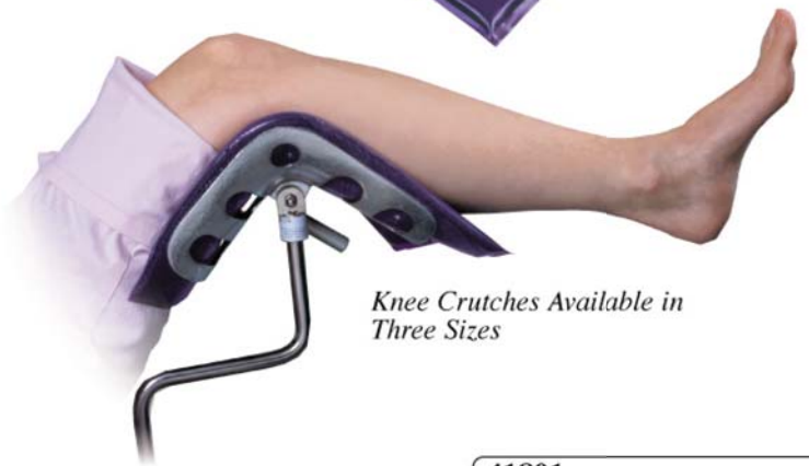
Knee Crutches Available in Three Sizes