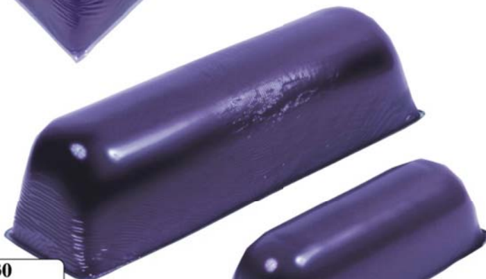
41830 Chest Roll