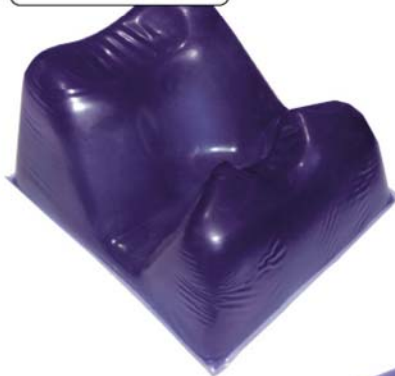
41834 Prone Head Rest