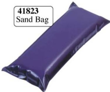
Sand Bags Available in Two Sizes