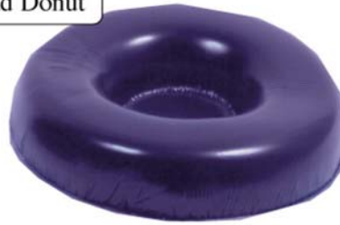
41805 Adult Head Donut