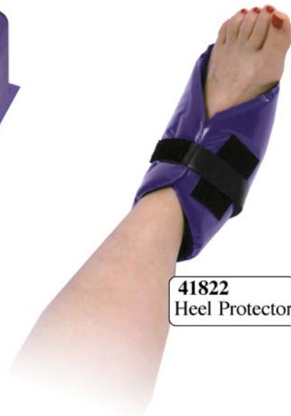
41822 Heel Protector