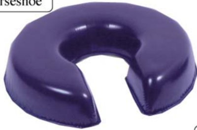
41806 Adult Horseshoe